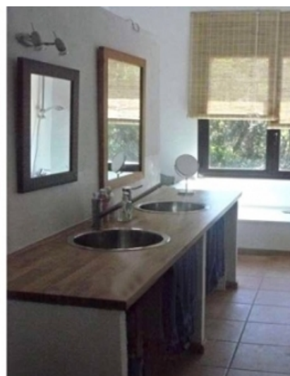
Fully equipped bathroom