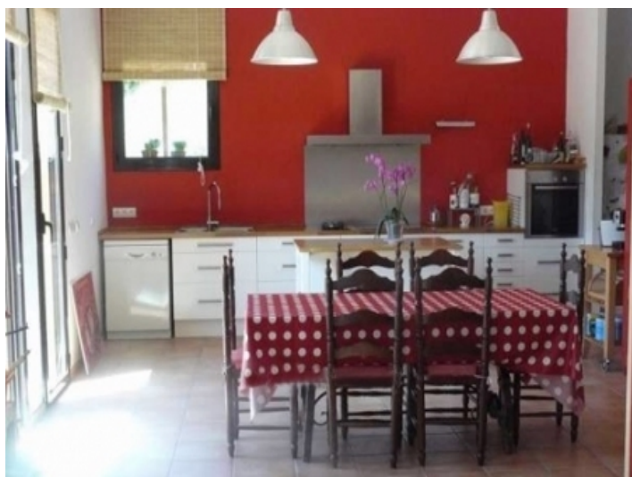
Beautiful dining room