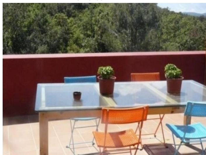
Sun-terrace with seating