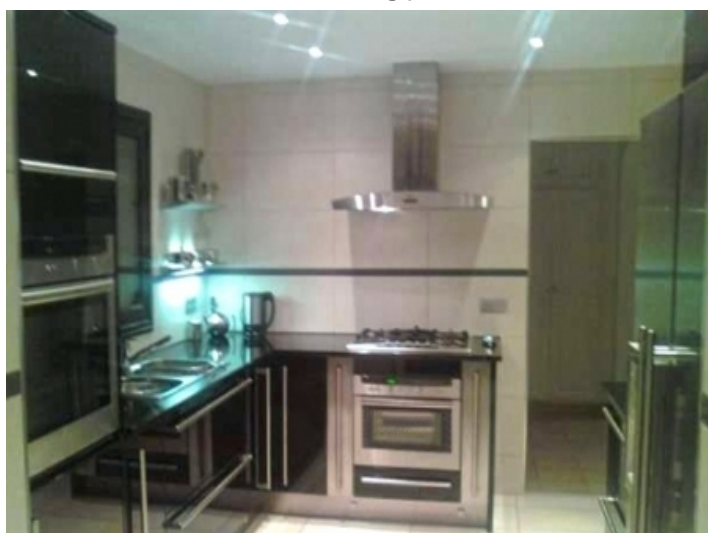
Modern fitted kitchen