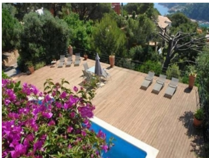
Dream swimming pool area