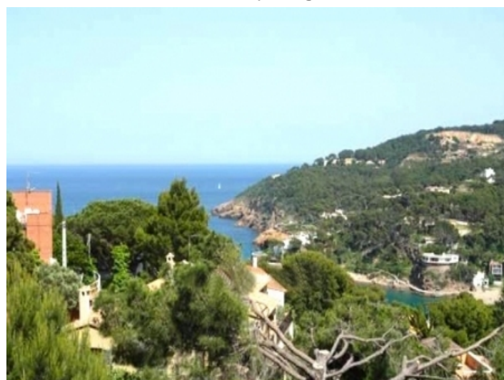
Breathtaking sea views