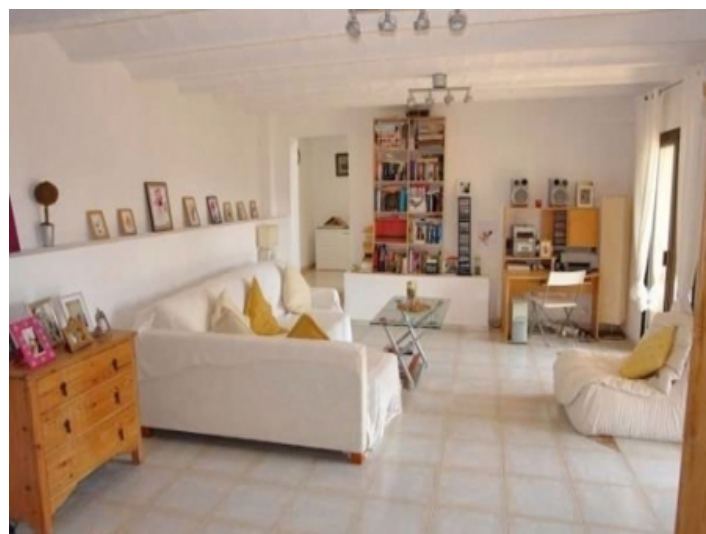
One of the airy living rooms