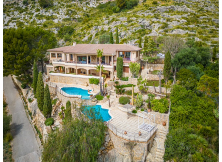
View of the villa