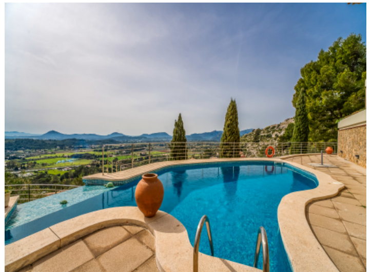
Pool with amazing views