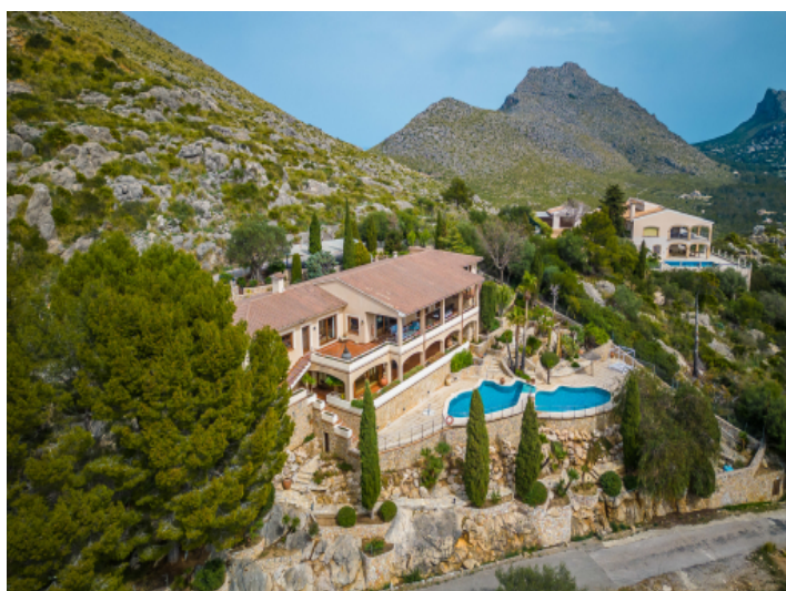
View to the villa