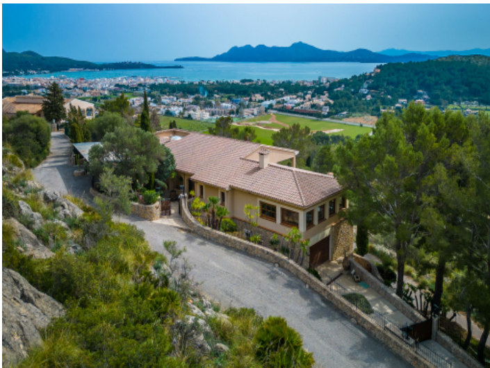
Stunning sea views