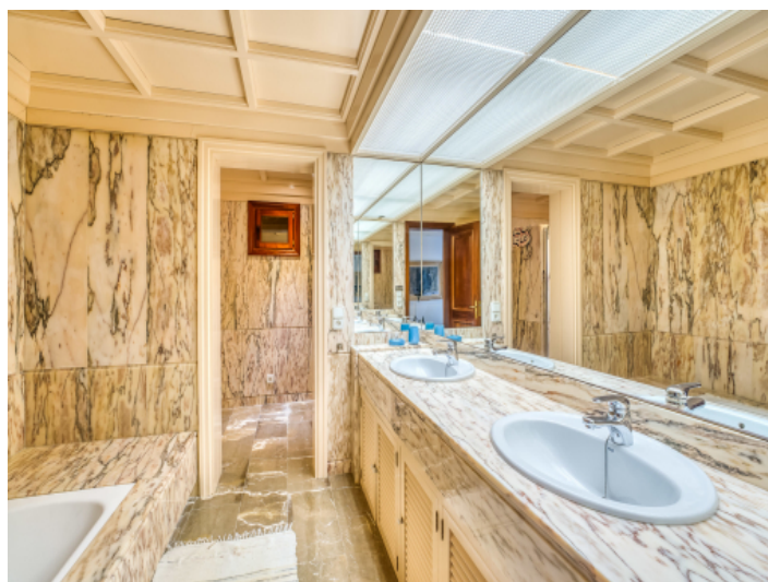
On eof 4 bathrooms