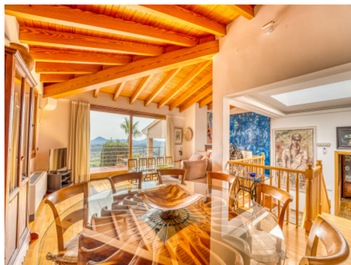
Living and dining area on the upper floor