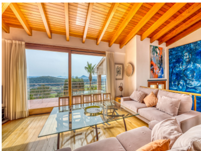
Relax with amazing views