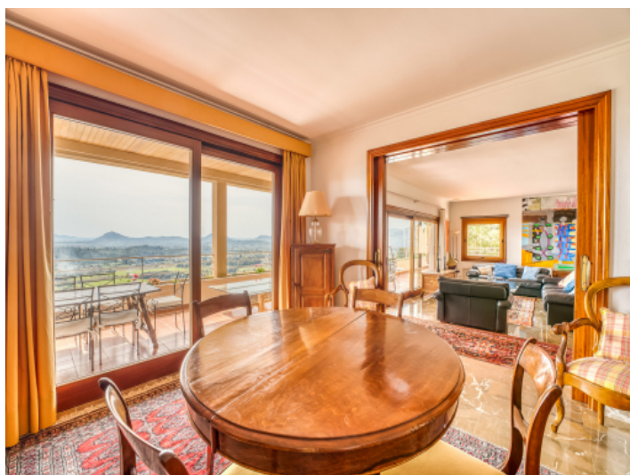
Dining area with sea views