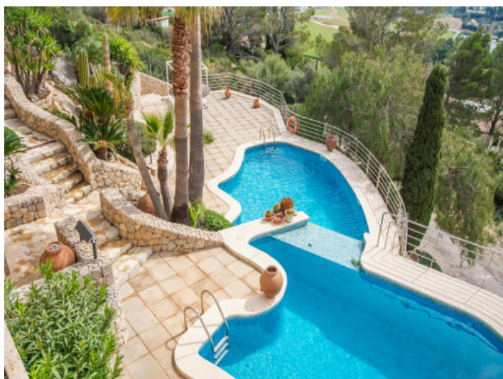
Pool on 2 levels