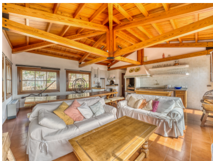
Open plan design on the rooftop floor