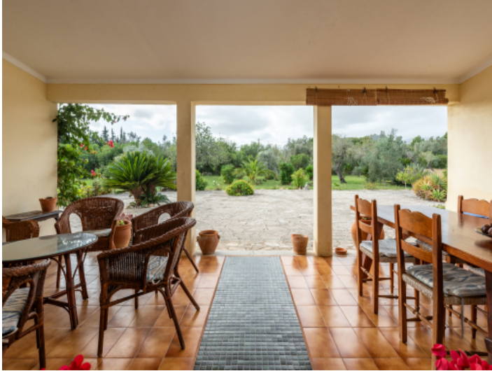
Covered terrace with garden views