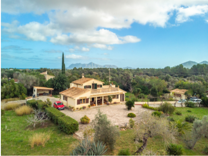
Views from the garden to the villa