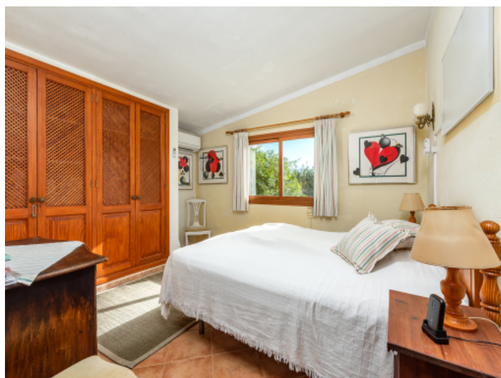
Bedroom with built-in wardrobe