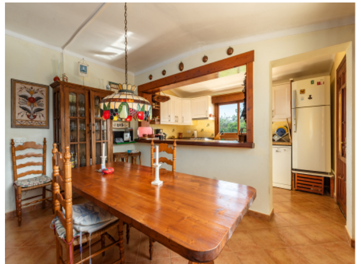
Dining area with views to the kitchen