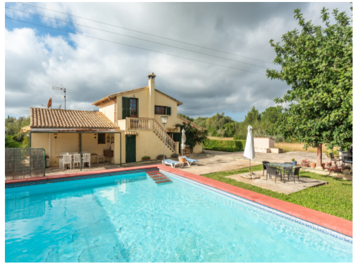
Villa with a large plot and pool in Pollensa