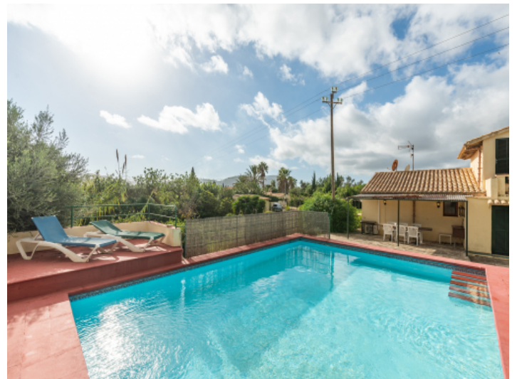
Pool surrounded by a terrace