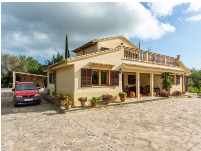
Ample terrace with parking space