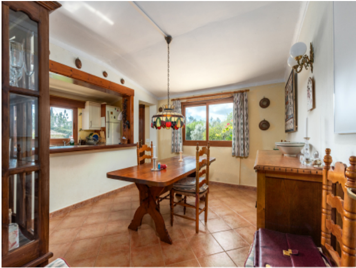
Open kitchen and dining area